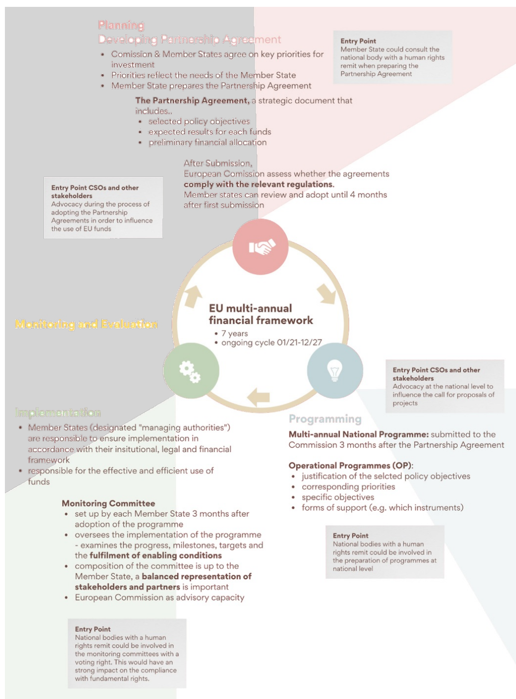
Figure 2 – Entry points for independent fundamental rights bodies in the stages of the programming period

The diagram is a graphical representation of the EU multi-annual financial framework. The potential entry points for bodies with a human rights remit or civil society organisations to consult, monitor or advocate on behalf of their mandate are during the planning, implementation and programming phases. At planning stage the entry points are when a Member State could consult with the national body with a human rights remit when preparing the Partnership Agreement and when advocacy takes place during the process of adopting the Partnership Agreements in order to influence the use of EU funds. During the implementation phase the entry point occurs when national bodies with a human rights remit could be involved in the monitoring committees with a voting right. During the programming phase the entry points occur when there is advocacy at the national level to influence the call for proposals of projects and also if national bodies with a human rights remit are involved in the preparation of programmes at national level.