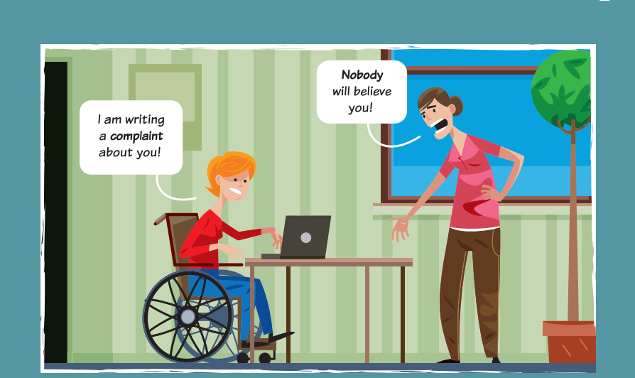
Access to Justice Article 13 CRPD