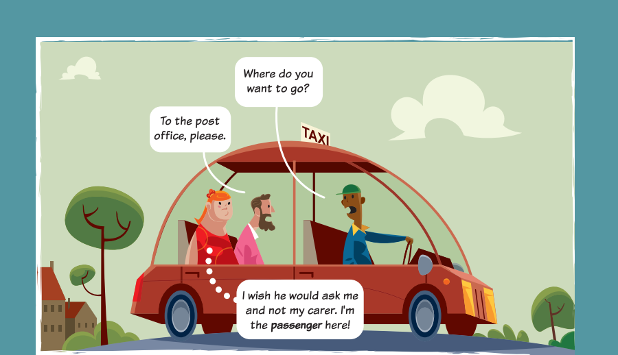
Equality and non-discrimination Article 5 CRPD