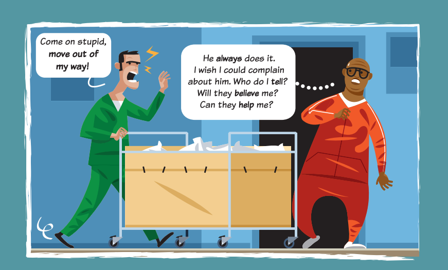
Freedom from exploitation, violence and abuse Article 16 CRPD