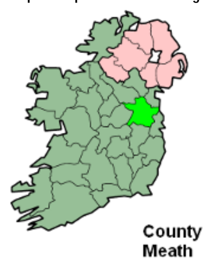
Map 1 - Map of Ireland indicating the location of County Meath