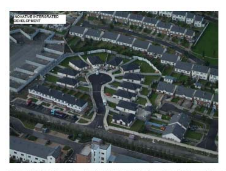
Photo 1 – Examples of recent group housing and halting site schemes in South Dublin ^{87}\,

Site at Daletree Place showing the old site that has been closed and new integrated group housing development as part of the community.