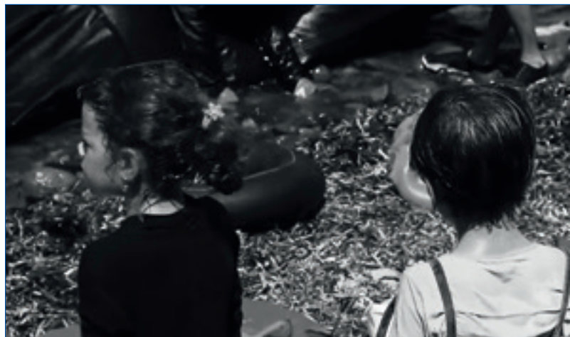
Source: FRA video (2017), ‘A decade of human rights protection: The EU Agency for Fundamental Rights turns 10’

The situation calls into question compliance with numerous Charter rights, including the rights to asylum (Article 18), respect for private and family life (Article 7), an effective remedy (Article 47), integrity of the person (Article 3) and liberty (Article 6) as well as the prohibition of refoulement and collective expulsion (Article 19). Evidence collected through the agency’s operational engagement and research underlines particular risks associated with children arriving in large numbers. They make it harder to fulfil Article 24 on the rights of the child in conjunction with the above rights. 132