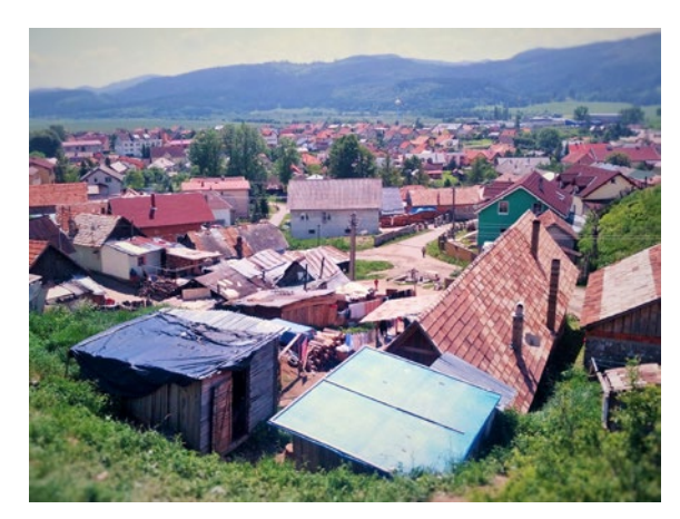
Hrabušice – on the outskirts of the village, a neighbourhood with partly informally built homes in poor condition is inhabited mostly by Roma, while other Roma families live in more integrated parts of the village where housing conditions are better

The research also shows that tensions within the Roma community can spill over and cause delays in project implementation. For example, in Megara, the Roma