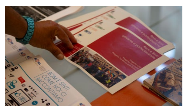
Bologna – local Sinti and Roma discuss their views on the main challenges to social inclusion and the lack of community spokes-persons and mediators