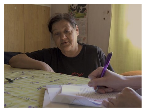
Brno – conditions for entering the 'Housing First' lottery were discussed between local residents and the local team in an open and transparent matter

Another transparency-related consideration worth taking into account during the local intervention was the need to openly communicate to the local community how the data or information collected would be used. This is particularly relevant to interventions which include a survey, census or a questionnaire - as was the case for example, in Megara, Stara Zagora, and other localities. This need became apparent during the pilot phase, as some local Roma raised concerns regarding the survey, and in particular relating to the fact that it was not clear to them how the collected data would subsequently be used by the regional and local authorities. Such a need stems from the fact that, as the Greek fieldwork expert explains, "many projects and organisations had conducted surveys and research in the Vlycho settlement without going back and presenting the findings or offering a general follow-up to the Roma people [whici] resulted in the Roma people being sceptical about the usefulness of the survey and unwilling to take part". As expressed by the President of the Local Roma Association in Megara, "I estimate that 10 % of the 4,000 Roma might decline to respond because they might be afraid of providing data and this is why a full understanding of the reasons for conducting the survey is needed". To this end and to avoid any misunderstandings and doubts as to how the results would be used, the project team in the Vlycho settlement planned a survey launch event.