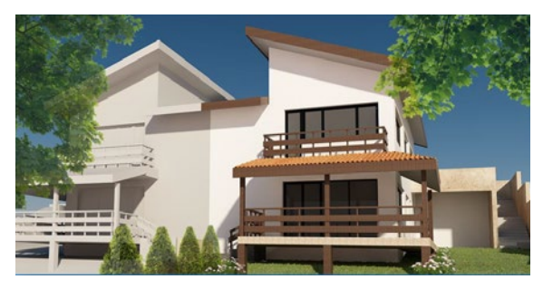
Stara Zagora – visualisation of a model modular semidetatched house developed by an architectural team of the University of Architecture, Civil Engineering and Geodesy Sofia, presented at the consensus conference in April 2016