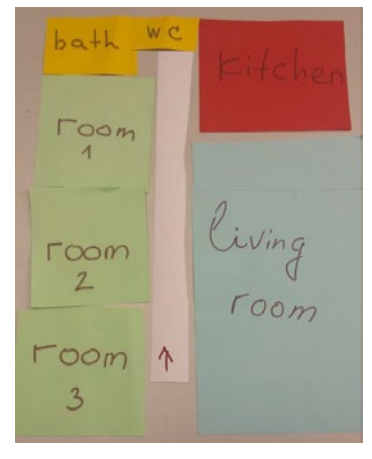
Stara Zagora – local residents from the Lozenetz neighbourhood discuss their ideal housing and floorplan of a model house at a focus group discussion in February 2016