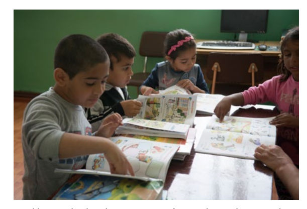
Pavlikeni – the local intervention focused on educational initiatives, including supporting participation in early childhood education

In Pavlikeni, one of the local interventions ended up being designed around educational initiatives, because through the preliminary needs assessment phase it became clear that local educational institutions were not able to access funding opportunities provided by the Science and Education for Smart Growth national operational programme of the European Structural and Investment Funds. Neither the staff within the schools nor the local municipal administration had the skills or experience necessary to prepare a project proposal.