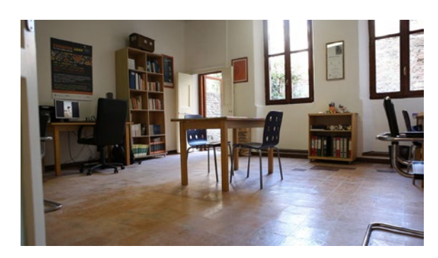
Mantua – the local intervention supported the creation of a cultural centre for the local Sinti community, transforming a rundown building into a place where Sinti culture and language can be promoted (©FRA)