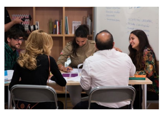
Cordoba – a local integration strategy was developed in a participatory way, including to help empower Roma women and youth