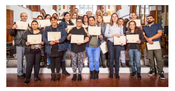
Medway – a local mediator was essential in helping to mobilise a number of Roma parents to take part in continuing education activities to improve their English language and job market skills (participants shown with certificates at the end of the course)

In a number of localities, informal Roma leaders and community mediators were essential to the research implementation, serving as key contact points for the local teams. Such was the case, for example, in Pavlikeni, where 'community moderators' had been helpful in past community development initiatives. In Medway, a dynamic mediator who was known and trusted by the local community helped to facilitate a number of activities, and was an essential co-researcher to have on the local team. Mediators often helped facilitate discussions and interaction where it was difficult for 'outsiders' to access the community and often acted as catalysts for engagement, being trusted persons who could communicate with both the community and outsiders. Similarly, community leaders played different roles in each locality, depending on their abilities, aspirations and ambitions. At times they were seen by the local communities as gateways to resources, in other cases informal leaders would speak on behalf of the community or dictate who could participate in the project activities. In Mantua, the local Roma association, Sucar Drom, was the key promoter since it has the unusual composition of including a direct representative of nearly every Sinti family in the municipality. It should be noted that the extent to which such leaders fully represent the whole community can vary, and the two roles of mediator and informal leader are often very different.