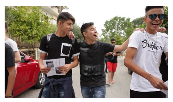
Aghia Varvara – Roma youth from the municipality on their way to the municipality office to communicate their ideas for how to improve community relations between Roma and non-Roma

Similarly, in Aghia Varvara, face-to-face contact and communication with all participants and stakeholders at all stages of the research process was essential for the implementation of project interventions. Particularly during a training on entrepreneurship, it was discovered that the majority of the entrepreneurs were unaware of open funding opportunities that were announced only on the websites of ministries and other national authorities. This was also verified by the limited participation in the local consultation forum, which had been announced on the website of the municipality and at Municipal Hall. Although young Roma in Aghia Varvara used the internet more widely than older Roma, even this proved to be an ineffective means of communicating employment, education or entrepreneurship opportunities among the young.