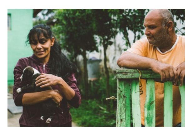
Rakytník – local citizens come from both Hungarian- and Slovak-speaking backgrounds

Local partners such as Roma mediators and representatives who had more experience with projects often helped, for example, in Megara and Aghia Varvara. The Roma representatives in Megara, namely the Presidents of the Roma Association and of the Union of Greek Roma Mediators, further helped with the implementation of the research activities. They suggested keeping the questionnaire that was to be completed via door-to-door interviews as compact and with as simple language as possible. Three local Roma co-researchers helped to pilot the questionnaire and identify potential difficulties related to the language and understanding of the questions, the cohesion of the questionnaire, and the time needed to complete it. Some slight adjustments related to specific questions and the overall length followed and all Roma respondents (all male and heads of households) found the questionnaire easy to complete and not too long, indicating a pay-off from making sure that accessible language is used.