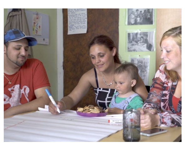
Sokolov – a young mother participates in one of the familybased learning activities developed as part of the local intervention

Another frequently observed limitation, for example, was the lack of necessary educational or technical skills, as well as formal qualifications to participate in the design or to carry out some of the project activities. For instance, in Sokolov, participants realised that parents and grandparents did not have the right educational background to support young children in their schooling and with homework. As a member of the community in the Czech Republic expressed it, "Now, when my daughter is in the sixth grade, I am at the end of my abilities. I do not know how to support her when doing her homework". To address this, participants suggested the development of a summer school for Roma adults who are interested in completing their education.