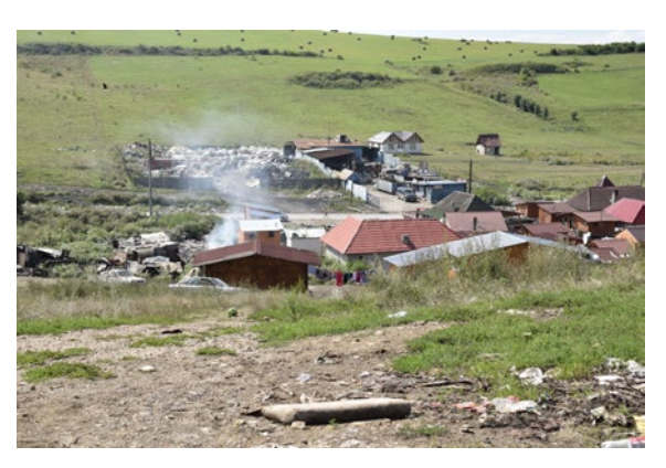
Cluj-Napoca – the local intervention focused on finding solutions to severe housing deprivation challenges, in particular among families living in an informal settlement near the garbage dump

of the fees, and subsequently developed an advocacy campaign to abolish pre-school fees. The intervention showed how immediate, tangible outcomes could build trust and capacity of the local people.