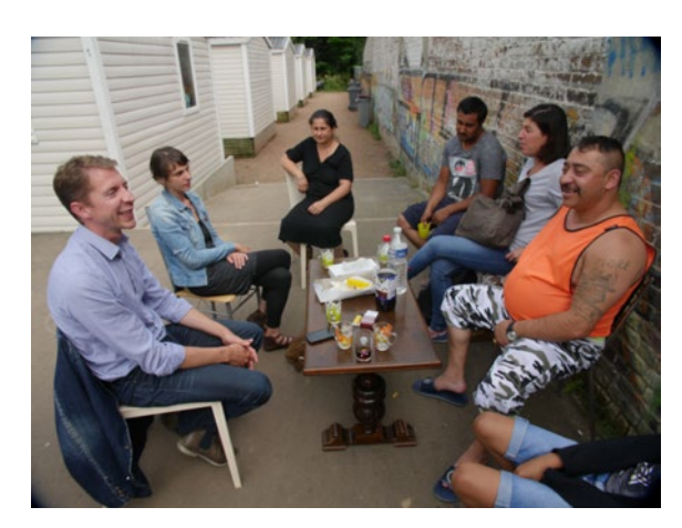
Lille – social workers from AFEJI participate in a meeting of the expression groups outside the homes of the Roma families. The expression groups allowed for Roma to vocalise their concerns, needs, and ideas

The prevailing understanding of citizens' participation in local politics and community life also affects their willingness to participate in projects. In Megara, for example, most Roma had difficulties to "understand the participatory approach of [the project] and its aim to co-design, plan and monitor particular actions", the Greece fieldwork expert explains. This was the case also in Rakytník, Slovakia, where a semi 'top-down' approach had to be adopted instead of the envisaged bottom-up methodology: the mayor and local council proposed ideas for interventions, which were then validated by the Roma community. The intervention in Lille experienced comparable challenges, as being consulted was new and unusual for the Roma families involved in the project. In the words of one AFEJI social worker from France, "In the case of some of the families, I really believe it was the first time that they had ever been asked what they want in their life".