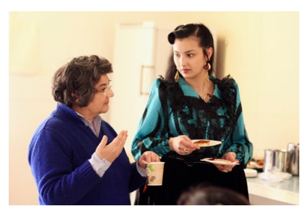
Jyväskylä – the local fieldwork expert in discussion with a Finnish Roma woman

sometimes needed in order to endorse and promote participatory approaches, which do not come naturally to local authorities. Similarly, the key promoter in Hrabušice was the fieldwork expert, who was proactive in mobilising the community members to participate in the research activities, facilitating a number of both community activation activities and PAR techniques – of course with support of the mayor, who had also been actively involved with the Roma community before the project.