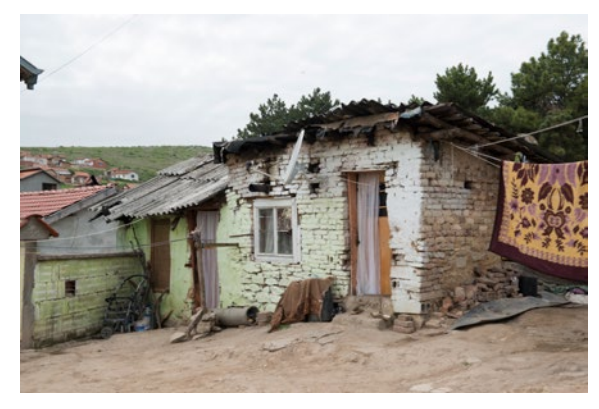
Stara Zagora – informally built houses in the Lozenetz neighbourhood before the demolitions

While initially reluctant to trust any housing relocation scheme, this – as a local Roma said – was different: "if it [the house] looks like that, I am going immediately to move in". While the houses were not actually built during the project period, a mutually agreed approach to the planning and other preparations were achieved through the project's participatory process.