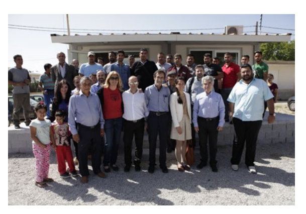
Megara – the mayor visits the Roma neighbourhood during a meeting to explain the research process and mobilise people to participate; outreach activities were often carried out within the neighbourhood