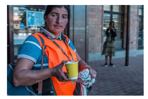
Helsinki – the local team convenes a women's group in an informal setting to discuss the issues and challenges they face in their daily lives and come up with ideas for project activities to help address income generation

Lessons learned from Lille revealed that integration policies designed in a gradual and iterative manner allow for the possibility of adjusting programmes as new developments or needs arise, which can bring better results. "A concrete example of this was the decision to extend the scope of the research project from Lezennes to all seven of the municipalities in the Lille Metropolitan area which set up 'inclusion villages'. Readjustments to the scope of the project were possible thanks to the cyclical and iterative nature of PAR. The possibility to re-plan and adjust projects during their implementation has particular benefits for projects concerning Roma integration, given the historical 'distance' which exists between Roma communities and project managers", the fieldwork expert explained.