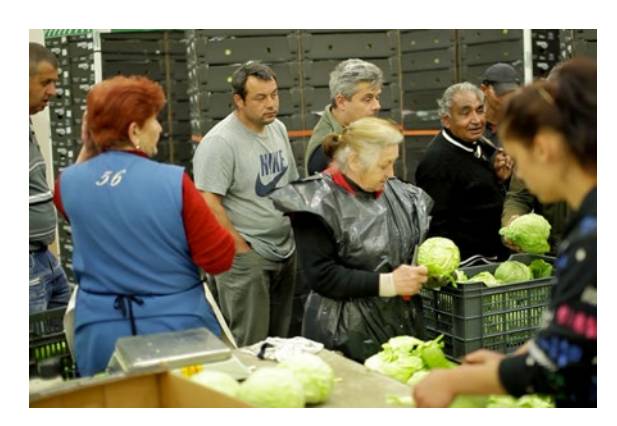
Besence – local residents on a study visit to learn more about how municipal-run social cooperatives can help provide employment opportunities

The research project had a short time frame and limited investment opportunities. Some fieldwork experts also felt that such a research project could not easily be communicated in a comprehensible way for the local people because they, as an expert from Hungary put it, "are not part of a scientific community". The aims and possible results of the project had to be clearly communicated, while also involving extensive consultation with the mayors, especially in the case of Besence. The local team managed expectations via community discussions and documenting all the views expressed. This required the continuous presence of the fieldwork expert in the community throughout the project implementation period.