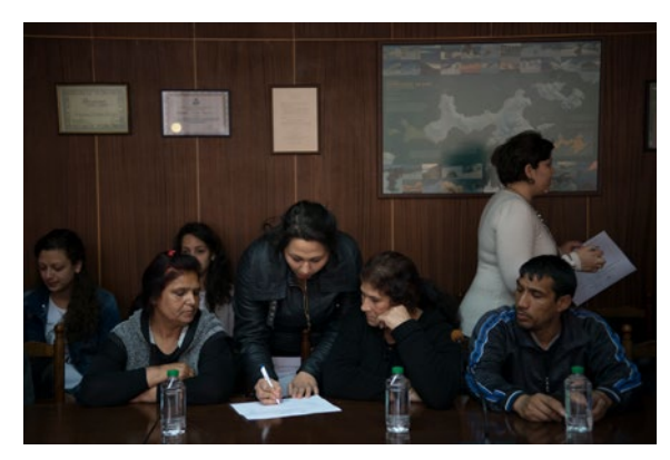
Stara Zagora – local Roma discuss the pending demolitions of homes in the neighbourhood of Lozenetz at a consensus conference in April 2016

A key challenge in this regard is how to motivate people to participate in inclusion projects in more meaningful ways and to foster an environment where the local community feels co-ownership over the design and implementation of project activities. For example, in Stara Zagora, a consensus conference was held to bring together the local authorities with Roma families from a segregated neighbourhood where demolitions of illegally built homes were taking place. Some of the families had already been displaced. Despite a number of different perspectives, varying opinions and personal situations, the participatory technique involved everyone in a way which helped to facilitate cooperation and get everyone's ownership over finding a mutually agreeable solution.