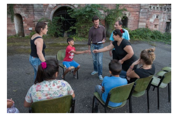
Strasbourg – children living in the municipal-run site participate in photovoice and theatre workshops as part of the local interventions