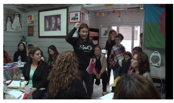
Madrid – a member of a local Roma feminist association mobilises a group of Roma women to discuss the idea of a feminist Roma congress

In several localities, the local authorities were more indirectly involved in the research through social service providers or other bodies coordinating services and support to Roma communities. This was the case, for example, in Helsinki, where the Hirundo drop-in centre provides support to Roma migrants and served both as the representative of the local authorities and as one of the main stakeholders for the project. Similarly, in Lille, the organisation AFEJI – hired by the Lille metropolitan area to manage the 'inclusion villages' - served as the main local stakeholder on behalf of the authorities and key partner in the research implementation. However, the fieldwork expert in Lille expressed a sense of disappointment in the limited involvement of the local authorities. He explains, "elected local politicians do not have the time to follow the [project] activities. There is a strong commitment to enhance cooperation, but in practice the local authorities did not provide financial or other types of assistance to [the project], nor did they attend the expression group meetings. However, they did permit AFEJI to go ahead with the plans".