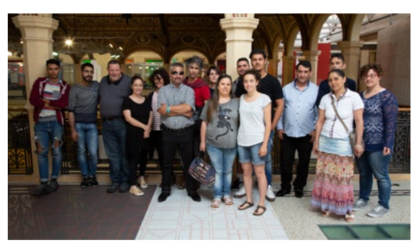
Bologna – Roma and Sinti spokespersons were trained and appointed through the local intervention to help bring the needs and challenges of the local community to the local authorities