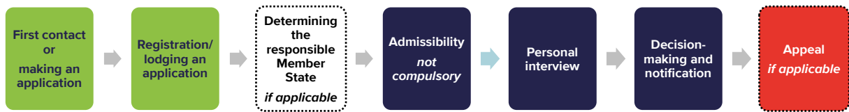
Figure 1. The key stages of the asylum procedure