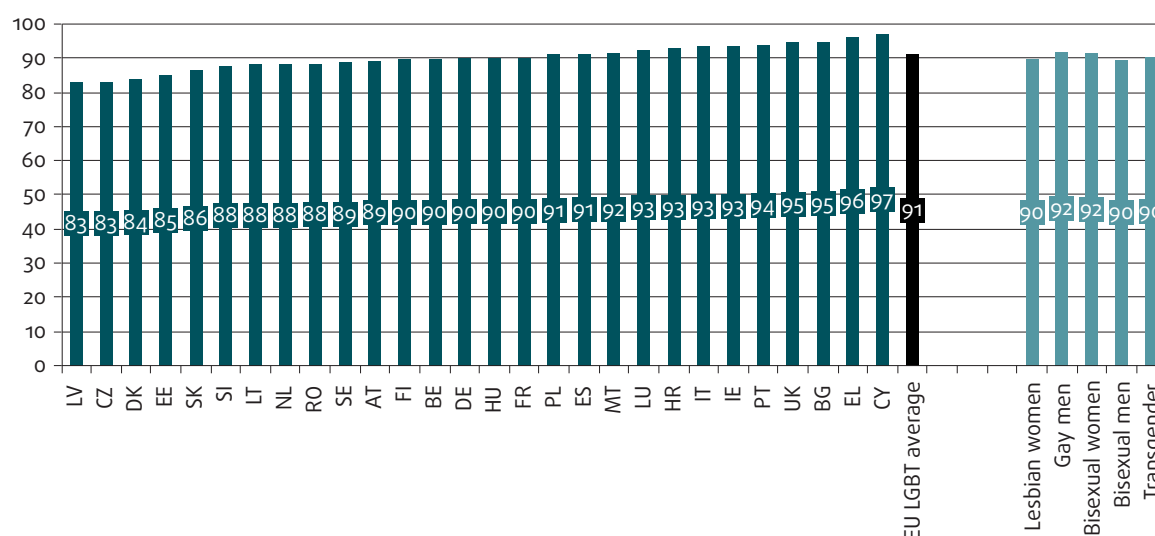
Figure 4.2: Heard or seen negative comments or conduct because a schoolmate/peer was perceived to be L, G, B or T at school before the age of 18, by EU Member State and by LGBT group (%)

Note: Answers include 'rarely', 'often' and 'always'.