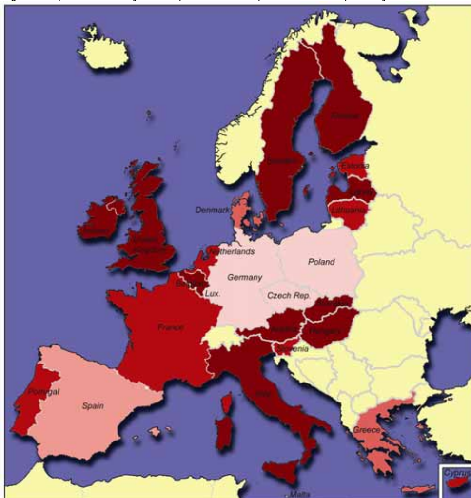
Figure 1: Specialised body for the promotion of equal treatment in place by the end of 2005