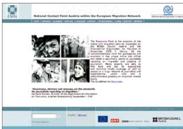
IOM Resource Pack for Journalists http://www.emn.at/media/

Drawing on his own professional experience as a journalist, Thomas Hammarberg called on political institutions to understand better journalists' professional ethics. Journalists needed to be wary of two main external threats undermining their independence: censorship and economic interest. Therefore, their professional instinct would be to oppose instrumentalisation for any specific political or social goal – even if they were desirable: “Journalists do not like to be megaphones of certain political interests. Yet, they are happy to contribute to positive developments simply by being good journalists.” Hammarberg accepted that ethical standards were the prerogative of journalists themselves. However, he saw the need to evaluate how effective self-regulation and voluntary bodies (complaints councils, media ombudsmen) had been. Hammarberg recognised the sensitivity of finding the right balance between freedom of expression and freedom of religion, as enshrined in the European Convention on Human Rights. According to him, more clarity is needed to define what constitutes a legitimate restriction of freedom of expression for the protection of the rights of others. He considered that more such