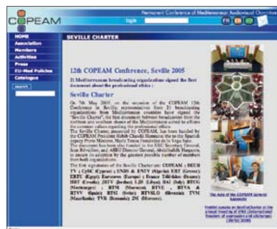
Seville Charter of Audiovisual Mediterranean Operators