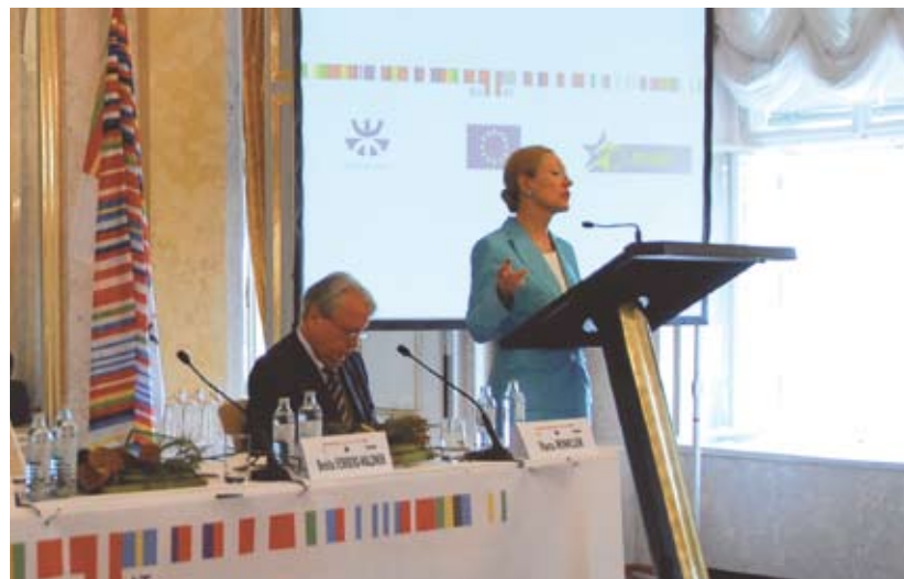
Benita Ferrero-Waldner, Commissioner for External Relations and European Neighbourhood Policy, European Commission

“There still remains a lot of work to be done to fight prejudice in the media and society as a whole, whether that be Islamophobia, anti-Semitism or other forms of religious or ethnic bias”