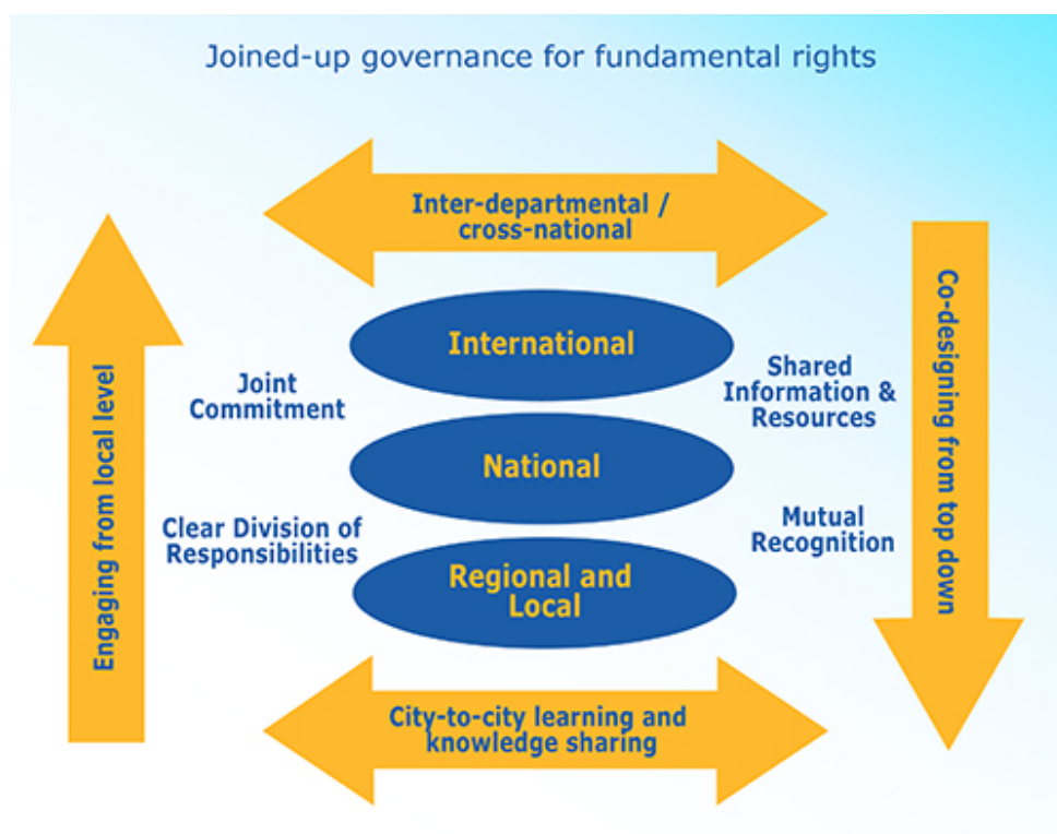
Figure 1: Joined-up governance for fundamental rights (FRA)