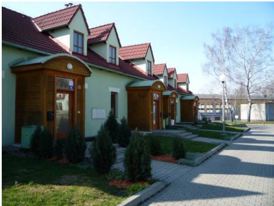
Photo 2 – Coexistence Village: housing and community centre (in the background)