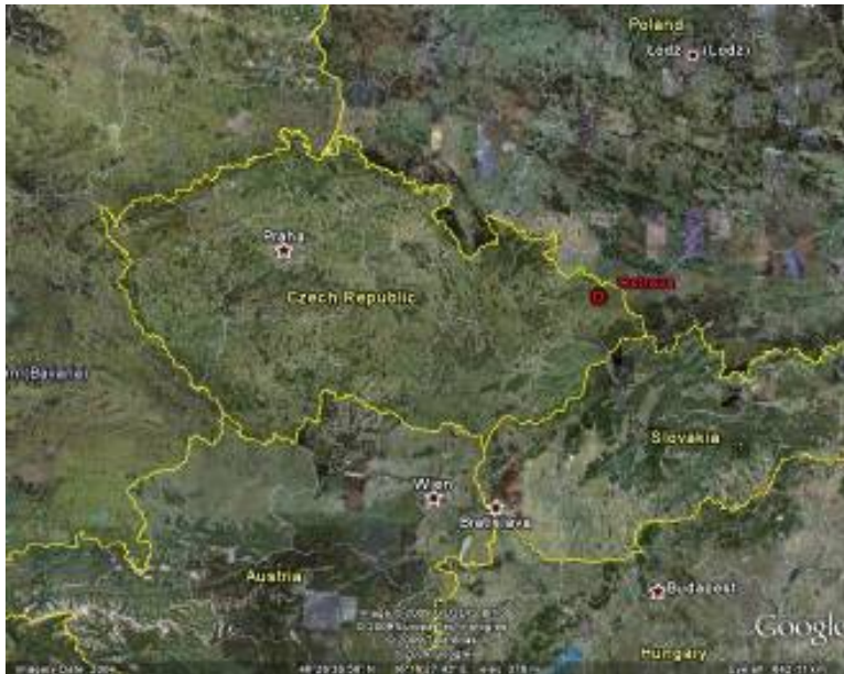
Map 1 – Location of Ostrava within the Czech Republic