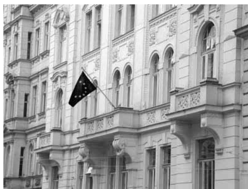
The EUMC premises in Vienna.

The central function of the EUMC is to assist in the development of effective policy formulation, whether at a European level or at the Member State level. The EUMC aims to help the EU and Member States develop practical policies that assist the fight against racism and related discrimination and support the positive integration of Europe's minority communities. Any