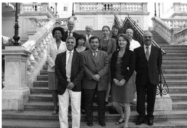
The participants of the joint EUMC-EESC meeting 2005.

In 2005, the EUMC and EESC strengthened their cooperation on fundamental rights, including on issues of racism and xenophobia. The EUMC and EESC held a meeting and adopted a Joint Action Plan that outlines common fields of action in