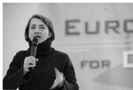
EUMC staff at the Youth Conference in Berlin.

The EUMC continued to make contributions to conferences and events supported by the DG Employment, Social Affairs and Equal Opportunities. The EUMC made a contribution at the seminar Roma in the Enlarged Europe, following the publication of the report Roma in the