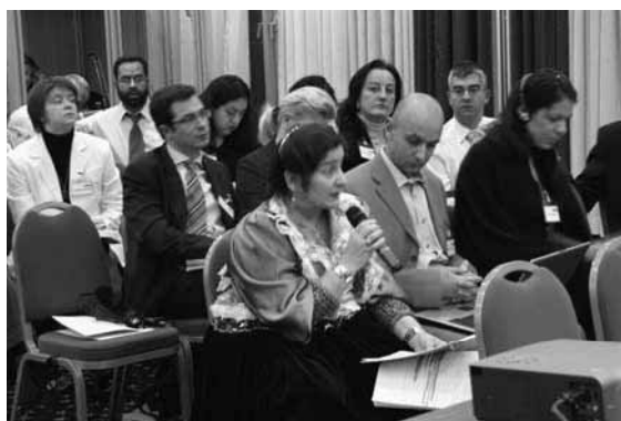
Participants at the EUMC's European Round Table Conference (ERTC).

The sixth European Round Table Conference (ERTC) was held on 28 and 29 November 2005 in Vienna. The meeting brought together 50 participants representing civil society, NGOs, social partners, specialised bodies, inter-governmental organisations and the European Commission. As in previous years, the