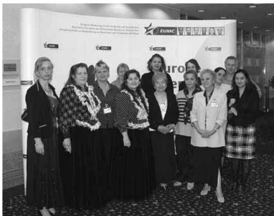
The EUMC Roundtable with the International Roma Women Network.

In March 2005, the EUMC held a round table with the International Roma Women Network. The objective of the meeting was to facilitate empowerment of Romani women through grassroots initiatives. The EUMC has also brought dialogue with Roma women into its wider dialogue with civil society, i.e. the European Round Table Conference. The EUMC