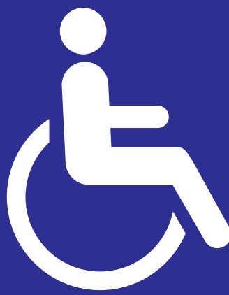
People with disabilities