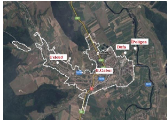
Map of Roma settlements in Aiud.

As part of two previous projects, a Local Action Group ( Grupul pentru Inițiativă Comunitară , hereinafter LAG) was established, bringing together representatives of local authorities, members of the Roma community and other relevant local actors, such as the school mediator and community nurses. In 2014, the LAG was restructured in the framework of the ROMED and ROMACT 14 initiatives, in order to contribute to the drafting of the new local inclusion strategy for Roma in Aiud. The group of participants was further extended to include informal Roma representatives of the three areas as well as the elected Roma councillor, who is considered to be the most important “pro Roma figure” in Aiud.