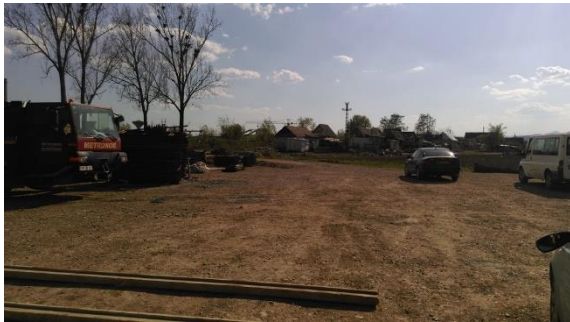
Proximity of the Infrastructural Project (an international highway) to the settlements in Bufa – approximately 15-20m away

The other main issue of concern for the local community is the plan to construct a national highway nearby Bufa and Poligon. The communities are worried about how this is going to affect their settlements.