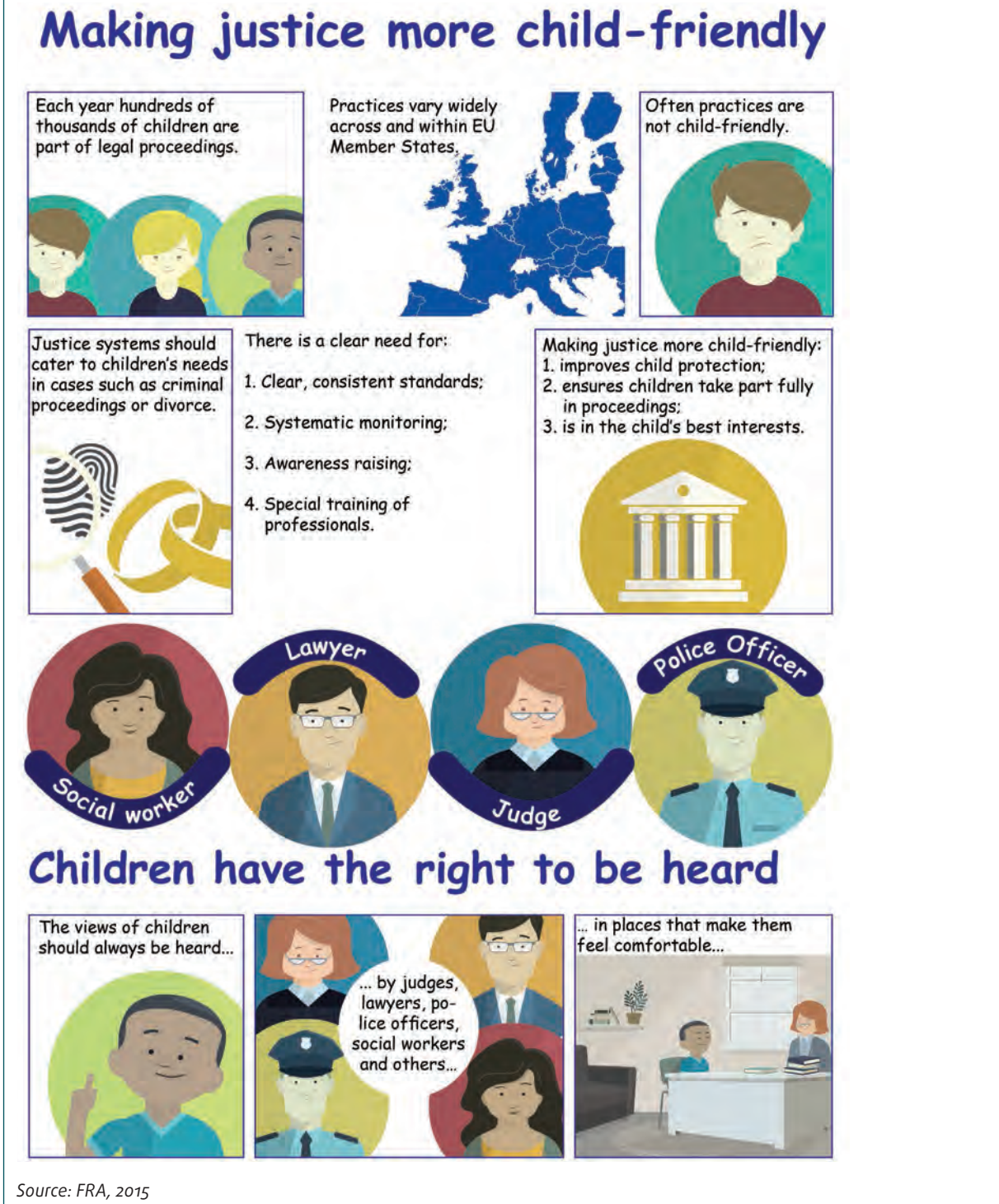
Figure 6.5: FRA's infographic on the right to be heard in judicial proceedings

cross-examine a child witness. Draft legislation in Bulgaria provides for child victims and witnesses under 14 to be interviewed a limited number of times and immediately after initiating the case. The authorities should always record interviews and use them as evidence. Interviews are to take place in specially equipped premises to avoid any contact between witnesses and defendants or their attorneys, and are to be conducted by specially trained experts. 125