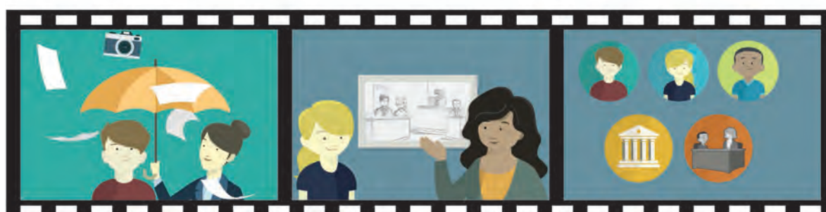
Figure 6.4: FRA videos help raise children's awareness of their rights

For example, draft legislation in Ireland provides children with access to support services, free of charge, according to their particular needs before, during, and for a period after criminal proceedings. 124 The Criminal Law (Sexual Offences) Bill 2015 aims to protect child victims of sexual offences from any additional trauma that may arise as a result of giving evidence during criminal trials; it introduces measures extending the use of video-recorded evidence and limiting the circumstances in which an accused can personally