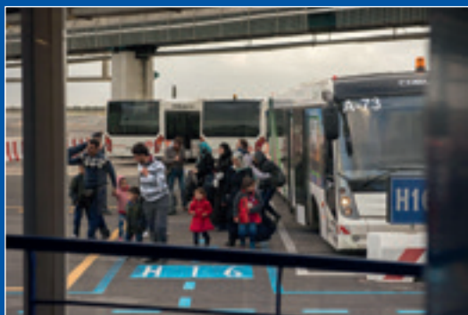
Refugees welcomed at Rome’s Fiumicino airport – safe travel made possible by Italian churches’ project for humanitarian corridors.

For more information, see Mediterranean Hope, ‘Corridoi umanitari’