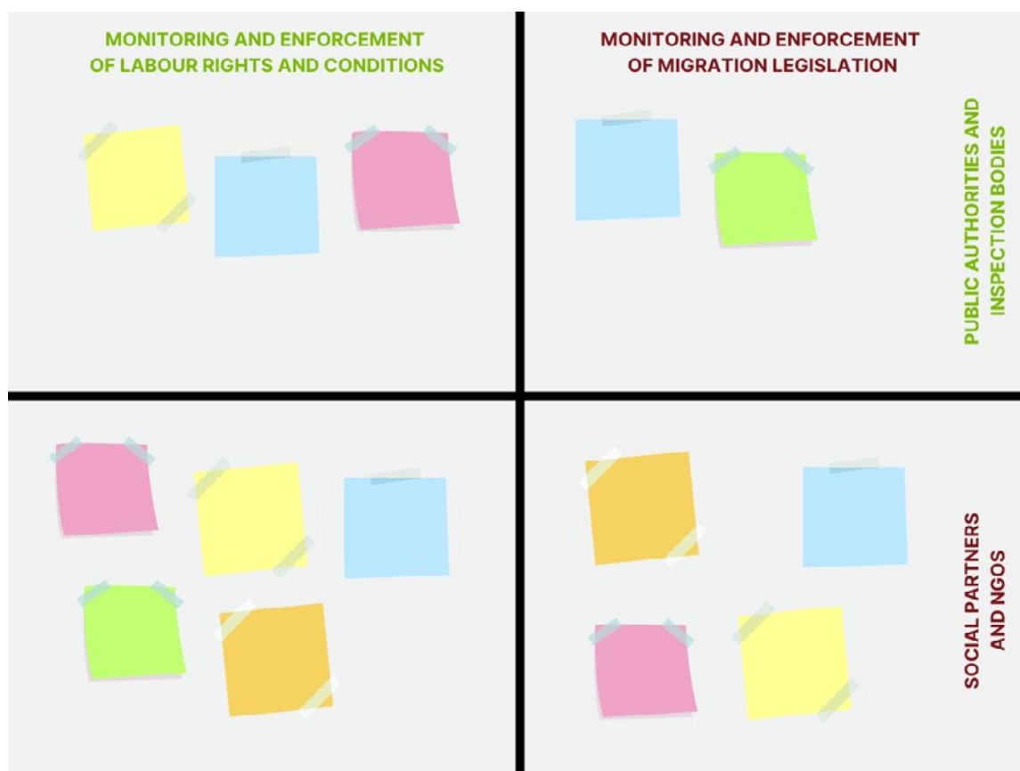
Figure 1: Illustrative four-quadrant map

Figure 1 illustrates the four groups to which organisations at the national level can be assigned, depending on their nature (public authorities or social partners / NGOs) and their function (monitoring/enforcement of labour or migration legislation).