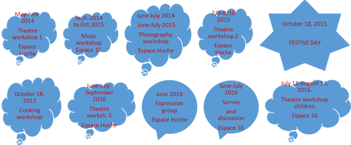
Figure 3. Timeline of Activities implemented in the local LERI research

The timeline of activities implemented in the LERI research between May 2014 and August 2016 is illustrated in Figure 2 below. An overview of the LERI activities in each integration area is then presented in the Table 2 below.