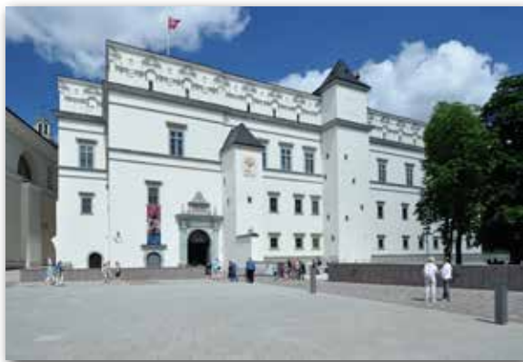
The Palace museum offers detailed information about the members of one of Europe's most powerful dynasties.

The 400 year old Palace of the Grand Dukes of Lithuania in Vilnius, which was destroyed 200 years ago, reopened its doors just in time for the beginning of the Lithuanian Presidency of the Council of the European Union. The Palace is once again a place of significant importance to Europe; from the 14th to the middle of the 17th century, Lithuanian rulers governed the entire region and envoys from Central and Southern Europe, the Ottoman Empire and Persia were received in the Palace. Today, once again, issues important to all of Europe are discussed here .