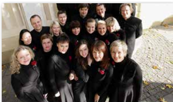
Jauna Muzika's repertoire includes choral a capella works from all epochs as well as vocal-instrumental music.

The Vilnius City Municipal Choir 'Jauna Muzika' is considered to be one of the best vocal ensembles in Lithuania. Every year, it performs at over 60 concerts in Lithuania and abroad.