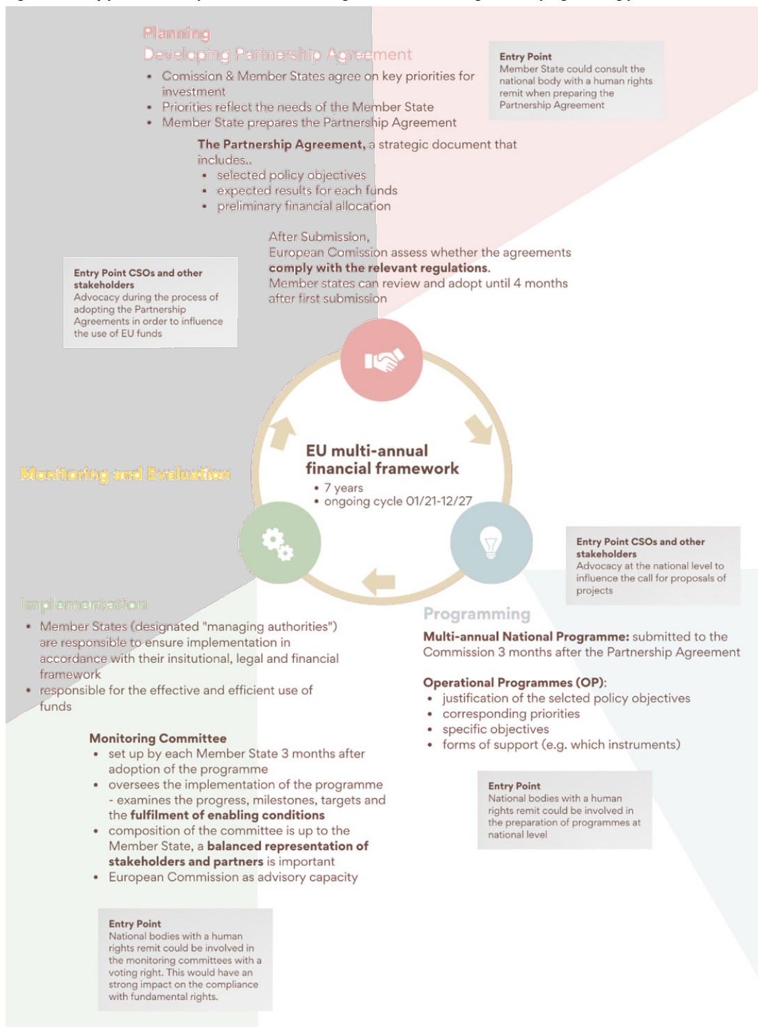
Figure 2 – Entry points for independent fundamental rights bodies in the stages of the programming period

The diagram is a graphical representation of the EU multi-annual financial framework. The potential entry points for bodies with a human rights remit or civil society organisations to consult, monitor or advocate on behalf of their mandate are during the planning, implementation and programming phases. At planning stage the entry points are when a Member State could consult with the national body with a human rights remit when preparing the Partnership Agreement and when advocacy takes place during the process of adopting the Partnership Agreements in order to influence the use of EU funds. During the implementation phase the entry point occurs when national bodies with a human rights remit could be involved in the monitoring committees with a voting right. During the programming phase the entry points occur when there is advocacy at the national level to influence the call for proposals of projects and also if national bodies with a human rights remit are involved in the preparation of programmes at national level.